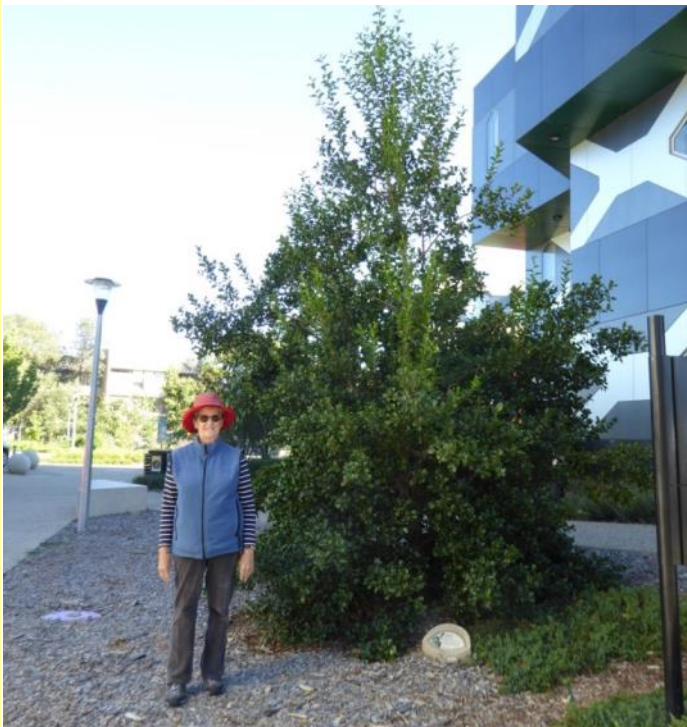
Soap bark tree at ANU

The soap bark is a small to medium sized evergreen tree, 10 –18 metres in height with a spread up to 10