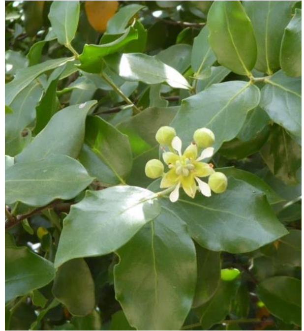
Glossy leaves and flower on a tree in Brazil