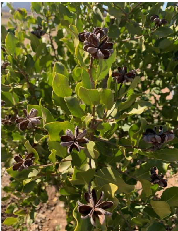
Young tree in Forest 94 showing pods in late August.

Soapbark is famous for the medicinal and commercial use of its inner bark, an abundant source of saponins—a group of bitter-tasting, organic compounds that produce a soap-like foam when shaken in water. The inner bark (sometimes sold as Bois de Panama) is dried, powdered, and used as an emulsifier and foaming agent in cosmetics, shampoos, whipping cream, beer, soft drinks, and even fire extinguishers. Soapbark saponins are supposedly poisonous when consumed at concentrations greater than the minuscule amount added to most commercial products.