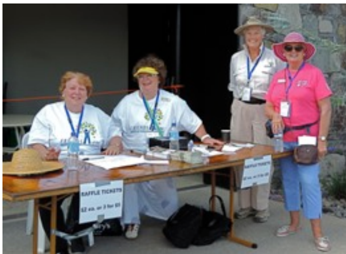
All smiles at raffle headquarters.