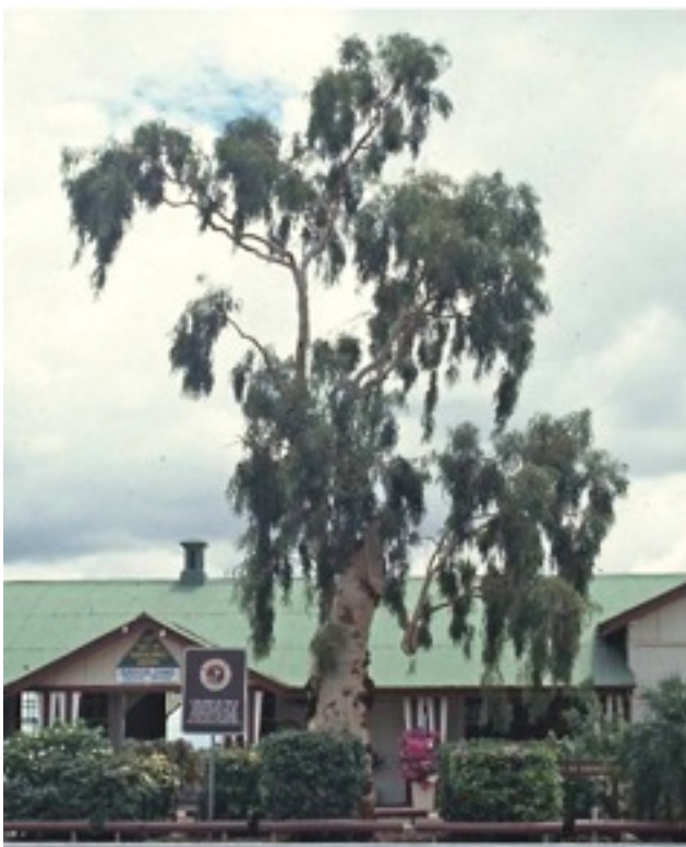
The Tree of Knowledge in Barcaldine in the late 1980s.

In 1991, this iconic tree was in average health and it was decided that attempts should be made to produce