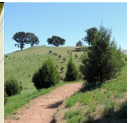
Above: The trail on the lake side of Dairy Farmers Hill.