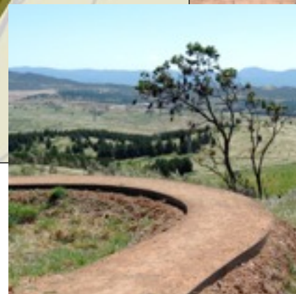
Left: The elevated hairpin bend provides wonderful views to the south-west.

After the ceremony, several of us walked the new circuit around Dairy Farmers Hill and we were very favourably impressed. Most of us were already familiar with the trail on the lake side of hill, but the trail extending around the back of the hill is more recent and has taken quite a