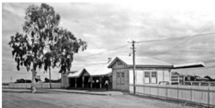
The Tree of Knowledge at Barcaldine Railway Station in 1938.

clones. However, root disturbance caused by the removal of bitumen around the tree prompted the production of a sucker. This was removed and potted, and, over the next five years, various attempts to strike cuttings were undertaken by forestry and agricultural department officers, but all failed and the project was abandoned. The potted sucker was left at the works depot in Gympie.