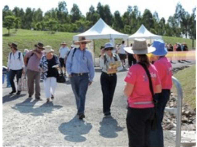
Two of our Friends near the gate, working as program sellers.