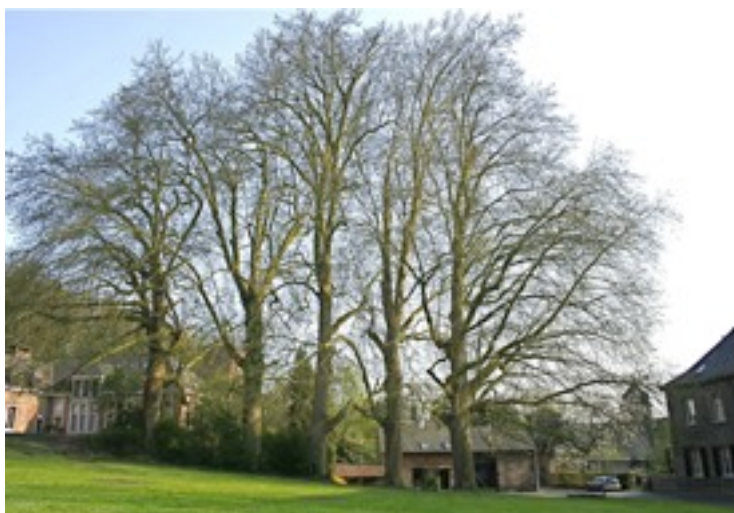
A row of mature oriental plane trees at the old Saint-Denis-en-Broqueroie abbey in Belgium